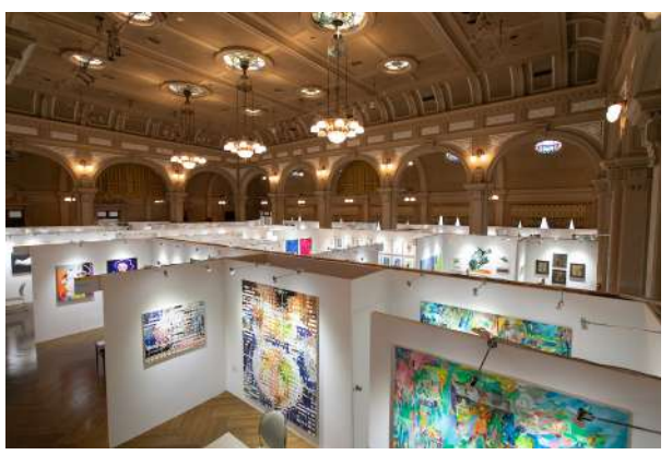
Installation view of ART OSAKA 2023 Galleries Section at Osaka City Central Public Hall